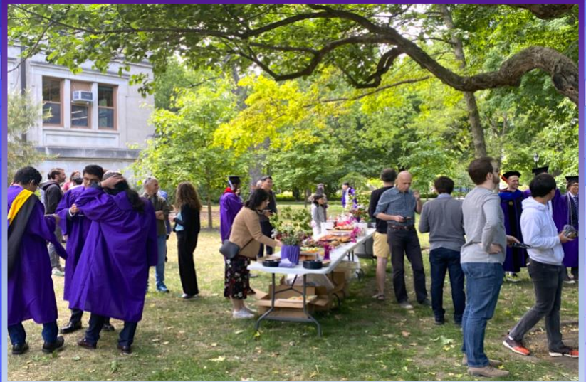
2023 Spring Graduation Reception for Math Majors, Minors and families