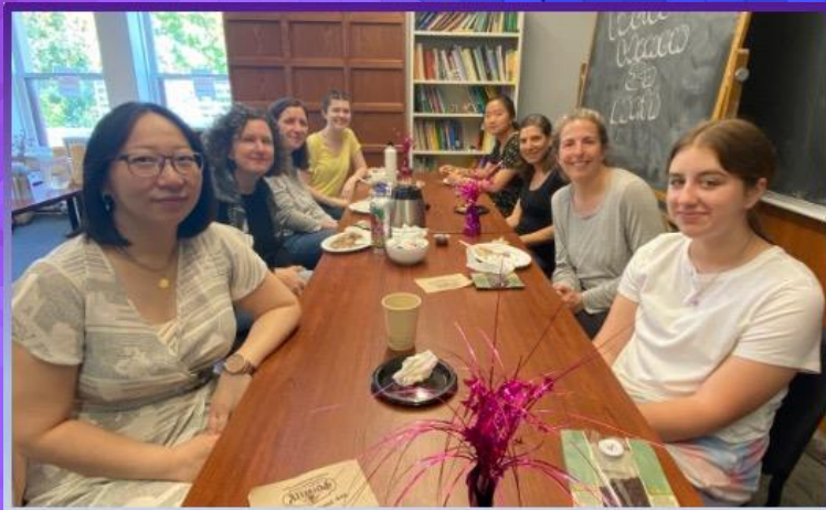
Math Dept faculty and students at the 2023 Spring Women in Math Luncheon