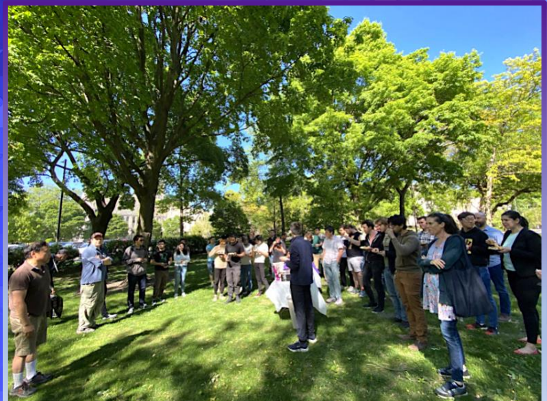
Math Dept members at the 2023 Graduate and Teaching Awards Celebration

Many thanks to all who support Causeway, and congratulations to our students!