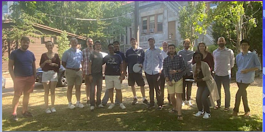
2023 Spring Causeway Program Celebration