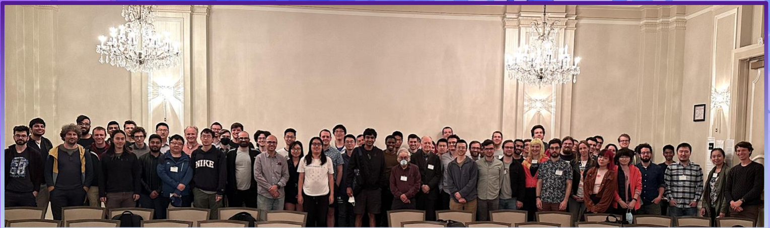
2023 Algebraic Geometry and Cohomology in Mixed Characteristic Conference