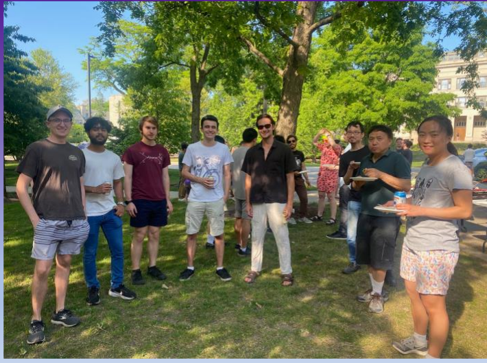
NU Math faculty members and graduate students at the 2023 Graduate Student Barbeque