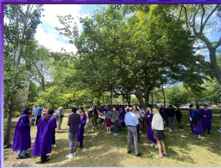
Math Dept members and families at the 2023 Mathematics Graduation Celebration