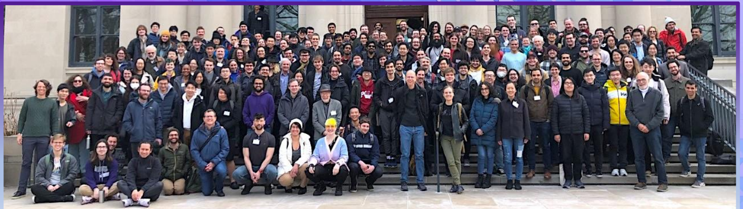
Homotopy 2023 Conference